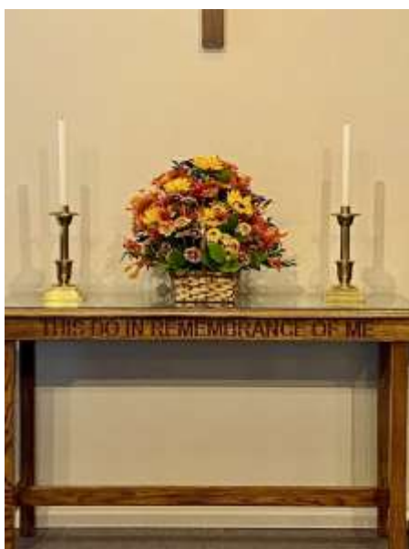
Beautiful Fall Altar flowers by AJ Laverty