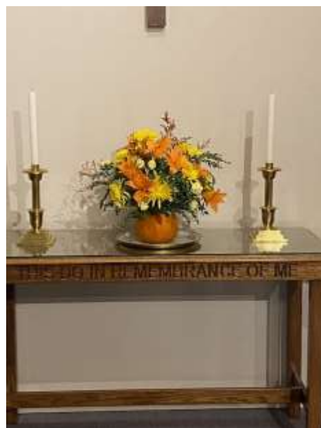
Billie Fitch's flower creativity is just so enjoyed by the whole congregation!