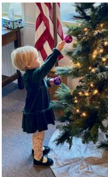
Our Littlest Member is not just about Missions, although she excels at that, she is also happy to help at any time with activities at the church. Here she is helping to decorate the Christmas tree in the Narthex,