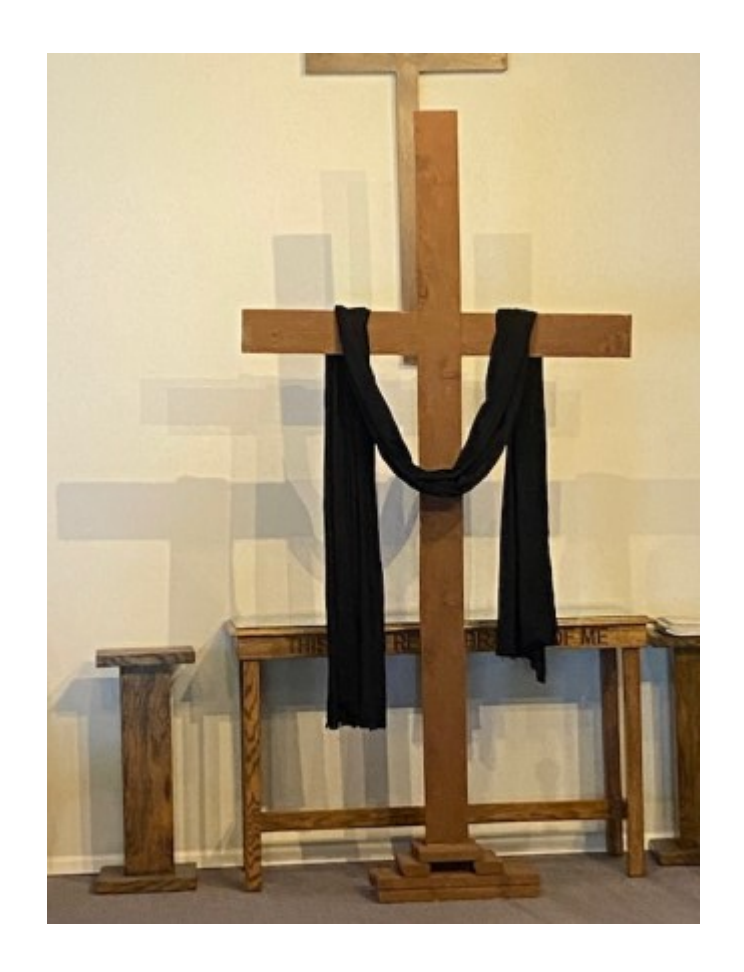
Good Friday Service