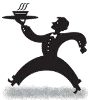
Italian sausage Minestrone Soup