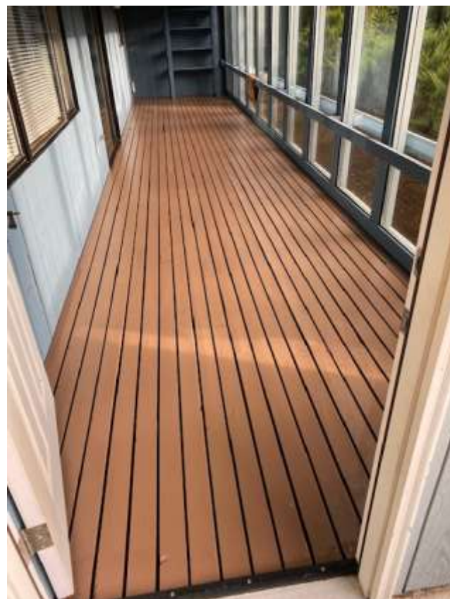
Before and after photos of freshly painted parsonage porch area. Thanks again to the volunteers who are some of our greatest gifts here at CUMC