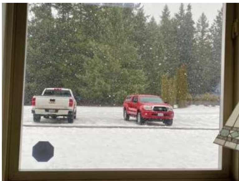
Winter wonderland at the church !