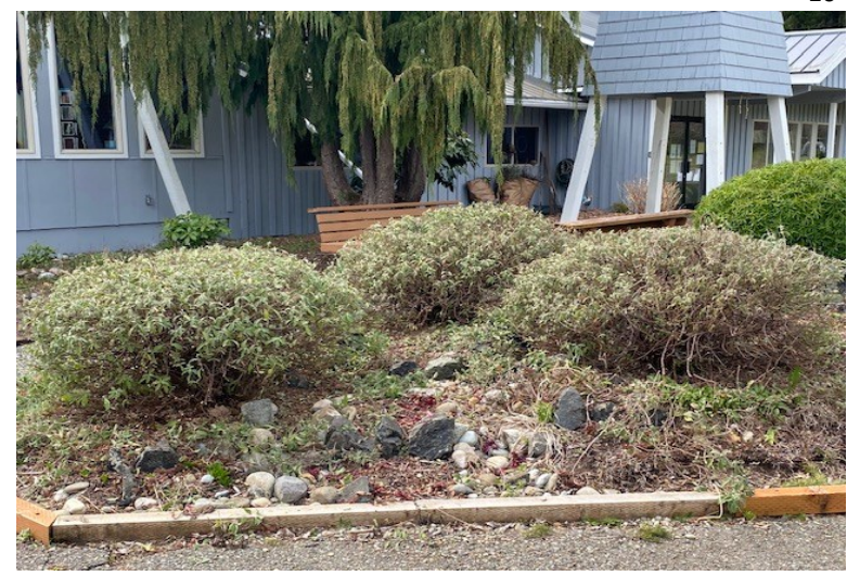
Before and after photos of a lot of hard work landscaping and generally sprucing things up around the church! Many thanks to ALL who helped! SPRING CLEANUP DAY WAS A HUGE SUCCESS! The church just shined on Easter morning .....