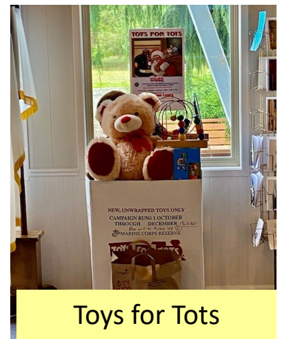
Toys for Tots