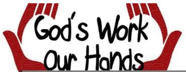
Making Fleece Scarfs