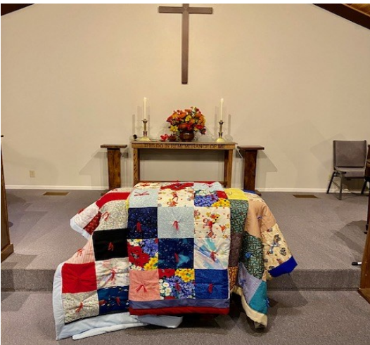
We blessed there beautiful quilts made by the loving hands of the Lutheran Church of the Redeemer for the residents of Peter's Place.