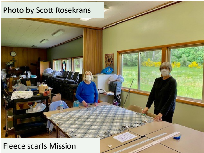
Fleece scarfs Mission