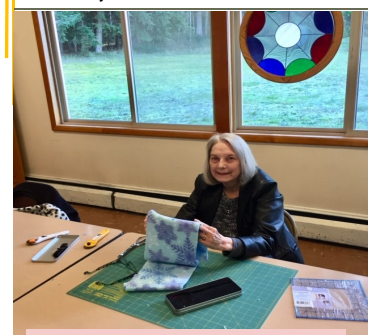
Fleece blanket making