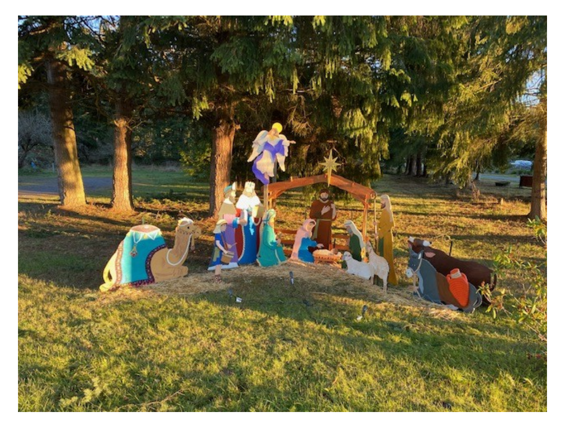
Outdoor Nativity Scene

Located on corner of Church Lane and Chimacum Rd.