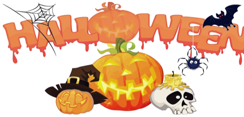
Halloween Party Photos from October 27th.