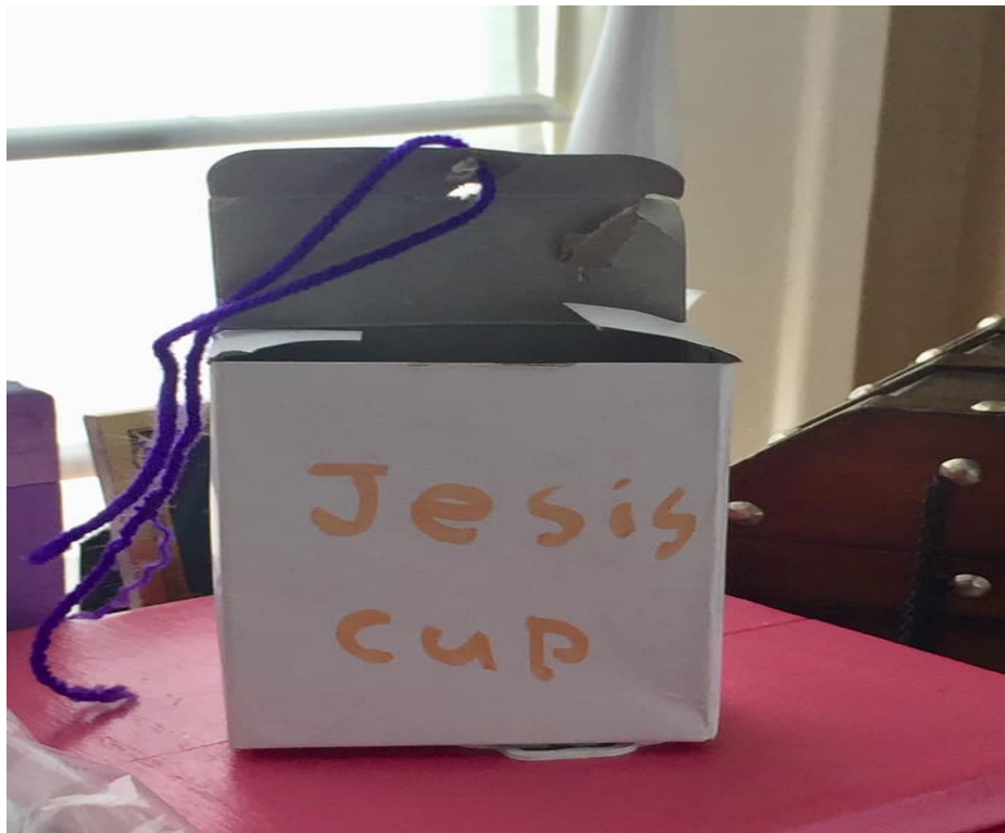
My granddaughter made her own Jesus Cup that she keeps in her room for spare change she saves for the Quilcene Food Bank. Never too young to make a difference

All are invited on this Advent journey to the Stable ... and beyond! Come even if you can't make it every week! Because we will order books for each participant, let the church office know if you are interested. 360-385-1579 - OR - cumc@olympus.net