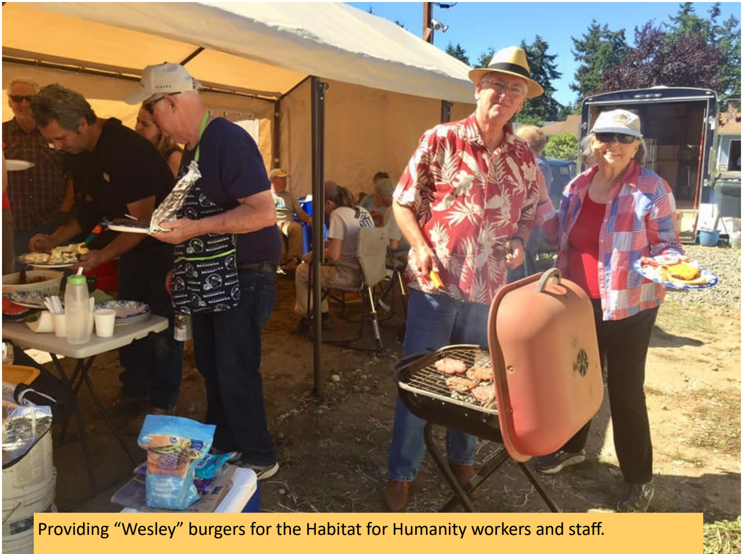
Providing "Wesley" burgers for the Habitat for Humanity workers and staff.