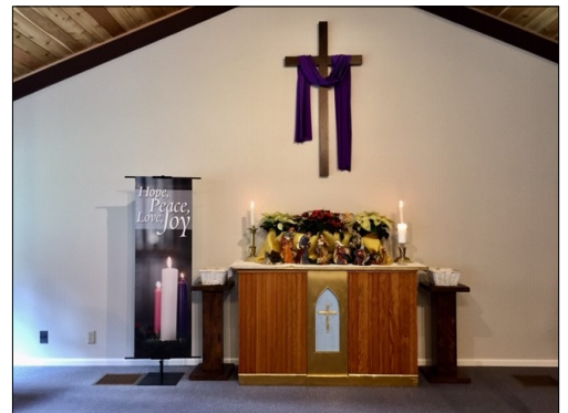
Photos of the Sanctuary during the Advent Season.