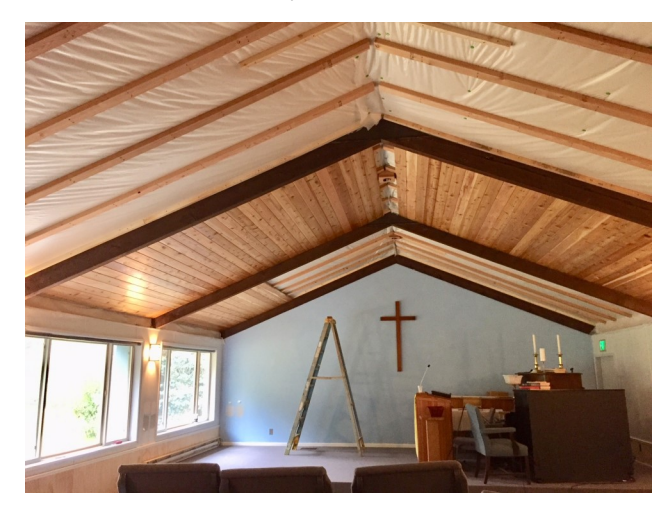
More photos on page 6